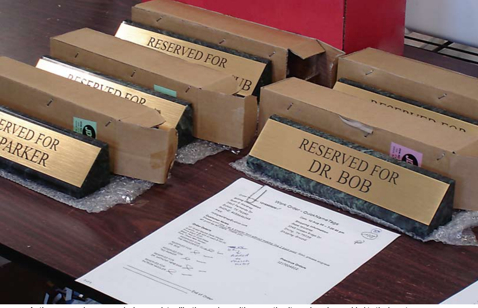
As the company has grown, desk nameplates like these, along with many other items, have been added to the inventory.