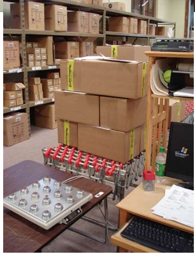
QuickTrophy keeps a lot of stock available, and 99 percent of items are shipped out the next day.

Reprinted from A & E Magazine - November 2008 ©2008 National Business Media, Inc. all rights reserved Please visit the <u> A & E Magazine</u> web site.